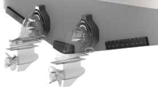
Zipwake Interceptor 450S V system installed on a boat.

In fact, a full quarter of Seakeeper's business now involves refits. Interested boaters simply need to determine which unit(s) will work best with their boats.