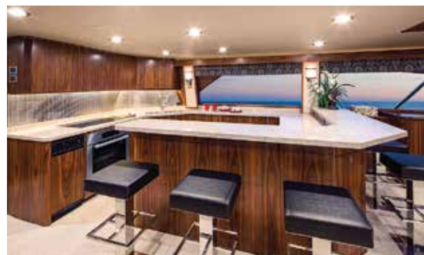
these pages The enclosed bridge (second from top) is used as a secondary salon, opening to a deck with aft-facing observer seating. The huge galley has wraparound granite countertops and five pedestal stools (bottom); it is open to the main salon's generous leather couch and inlaid dining table (opposite top). Offering no shortage of space, the full-beam master and its en suite showcase the use of walnut and marble (opposite bottom).

The interior is by William Bales & Company of New Jersey, which does many Viking interiors. In this case, walnut was chosen for the primary joinerwork and, with a satin finish, it is both warm and light. I have to admit that I would have thought walnut would have the gloominess of a British library, but this turned out to be exactly the right choice.