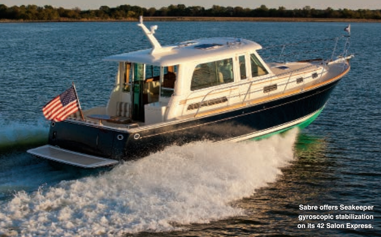
Sabre offers Seakeeper gyroscopic stabilization on its 42 Salon Express.